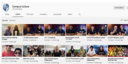
Core Values YouTube Channel